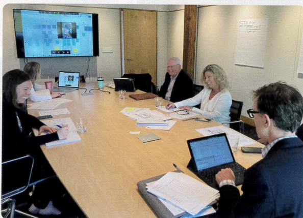
Members of the WRAC Planning Team and Bostwick Design

The WRAC center, designed by Bostwick Design Partnership, will be located in the Central neighborhood of downtown Cleveland—an area where CSA has served since 1865. It will be adjacent to the St. Vincent Charity Health Campus and near a plethora of other cultural facilities, such as the Rock & Roll Hall of Fame Archives, the Western Reserve Historical Society, and the Cleveland Public Library.